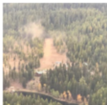
Approach to runway heading north