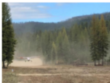
Backcountry 182 taking off from the ranch